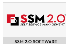
SSM 2.0 SOFTWARE