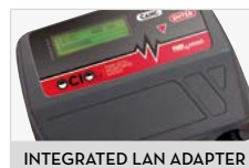
INTEGRATED LAN ADAPTER